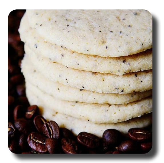
Copy and layout by Amanda Fortman