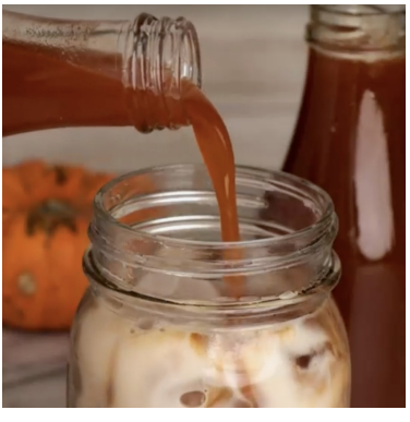
Pumpkin Spice Syrup Spice up your morning routine and practice economic sustainability by making your own homemade pumpkin spice syrup for your favorite beverage.