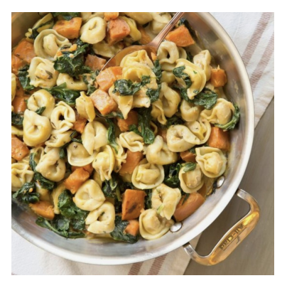
<u>Creamy Skillet Tortellini</u> Cozy up this October and rejuvenate with this creamy pasta dish, perfect for those chilly fall nights.

Refresh, renew, and rejuvenate with these fall festive recipes. If you are looking for a fun and seasonal challenge, consider using <a href="https://example.com/homemade/pumpkin/puree">homemade/pumpkin/puree</a> in your October recipes.